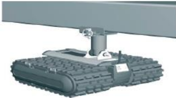
Illustration of the Camper Trolley mounted on the side members of the caravan: